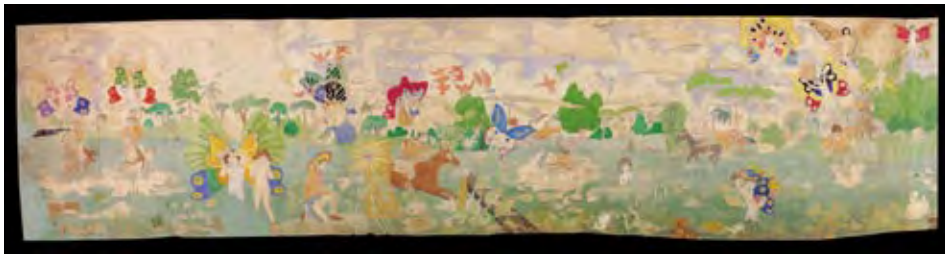
UNTITLED (Blengins Capturing Glandelinian Soldiers)