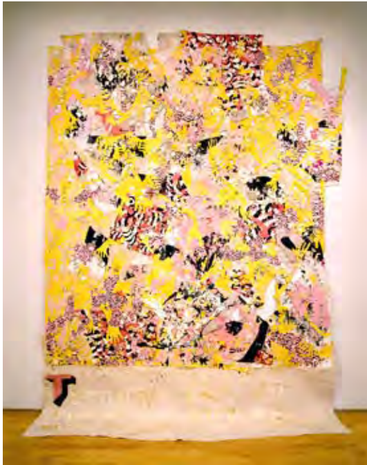
TORPEDO BOY TRIES HIS DARNEDEST TO STOP AN OOZING MOUNDMEAT

2001 Mixed media on canvas 138 x 100" The Lindemann Collection, Miami Beach