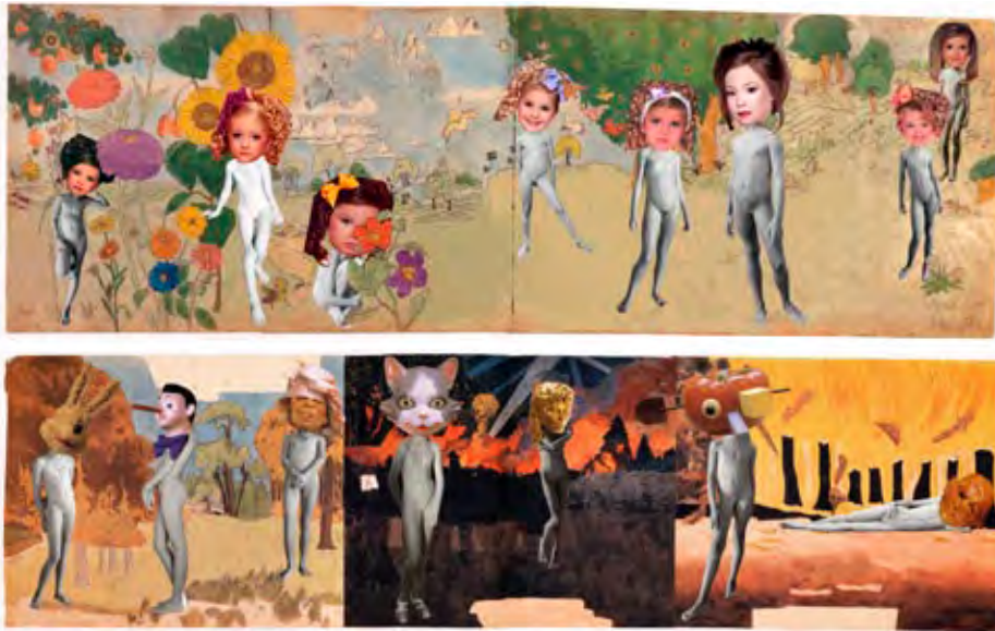
THANK HEAVEN FOR LITTLE GIRLS (double-sided)