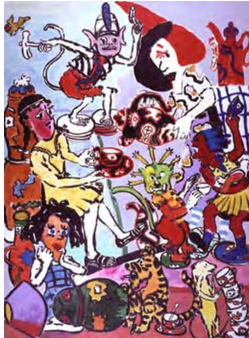
THE VIVIAN GIRLS BREAKING CHINA

1984 Acrylic on canvas 79 × 40" Collection of Paula Rego