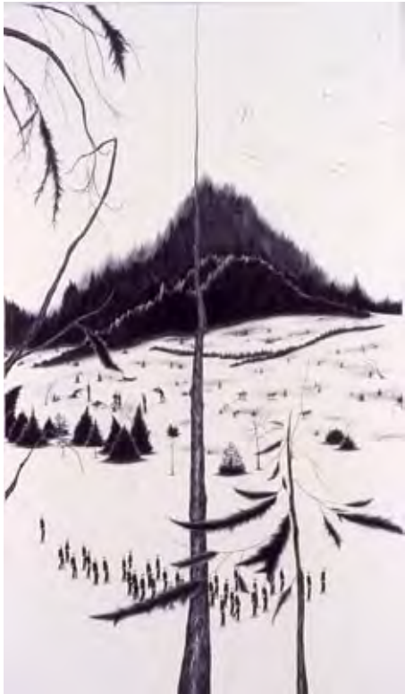
THESE MOVING BODIES, THESE NUMB PROCESSIONS