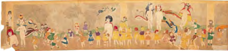
144 AT JENNIE RICHEL. WAITING FOR THE BLINDING RAIN TO STOP.