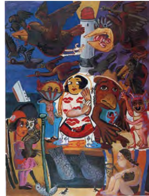
THE VIVIAN GIRLS AT THE END OF THE WORLD

1984 Acrylic on canvas 94 1/2 × 71" Collection of Isabel and José Dias Silva