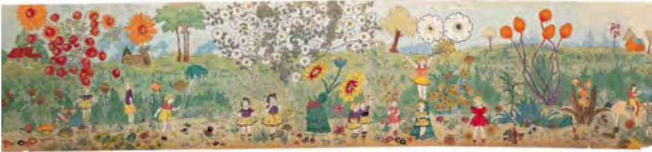
175 AT JENNIE RICHEL. EVERYTHING IS ALLRIGHT THOUGH STORM CONTINUES.