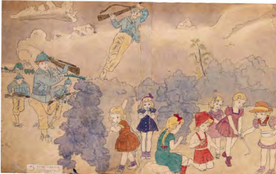
AT 5 NORMA CATHERINE. BUT ARE RETAKEN.