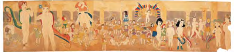
145 AT JENNIE RICHEL. HARD PRESSED AND HARASSED BY THE STORM