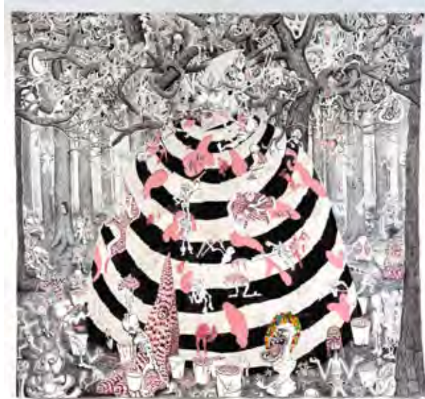
AND THE BRANCHES BECAME AS STORM CLOUDS

2001 Mixed media on canvas 138 x 100" The Lindemann Collection, Miami Beach