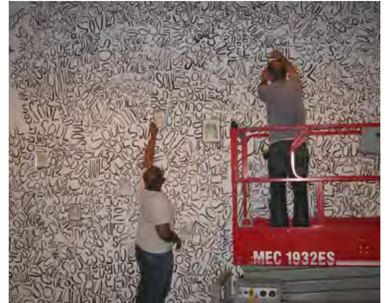
Trenton Doyle Hancock working on a site-specific installation for “Dargerism: Contemporary Artists and Henry Darger” at the American Folk Art Museum, April 2008

2003 Mixed media on canvas 95 1/2 x 102" Modern Art Museum of Fort Worth, museum purchase, 2004.4.P.P