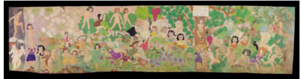
PICTURE ONE. THIS SCENE HERE SHOWS THE MURDEROUS MASSACRE STILL GOING ON BEFORE THE WINGED BLENGINS ARRIVED FROM THE SKY. THEY CAME SO QUICK HOW HOWEVER THAT THOSE FASTENED TO THE TREES, OR BOARD, AND THOSE ON THE RUN ESCAPED THE MUDERERIST RASCALS OR WERE RESCUED, AND FLOWN TO PERMANENT SAFTY AND SECURITY.