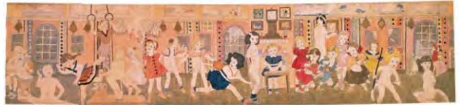
UNTITLED (Ornate Interior with Multiple Figures of Girls and Blengins)