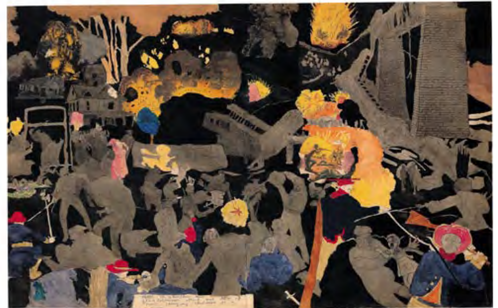
AFTER M WHURTER RUN GLANDELINIAN'S ATTACK AND BLOW UP TRAIN CARRYING CHILDREN TO REFUGE.