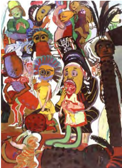
THE VIVIAN GIRLS IN TUNISIA

1984 Acrylic on canvas 79 × 40" Collection of Paula Rego