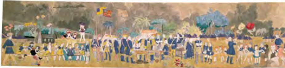
UNTITLED (Campgrounds in Stormy Landscape with Soldiers and Vivian Girls)