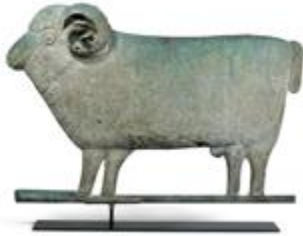
The Norwalk Mills Ram