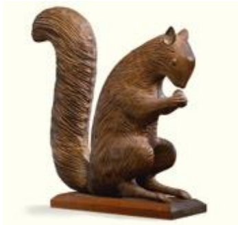
Pattern for Weathervane of a Squirrel Eating a Nut Harry Leach Boston, Massachusetts c. 1869–70 Carved wood 16 1/4 x 16 3/4 x 17 1/2 in. Private collection