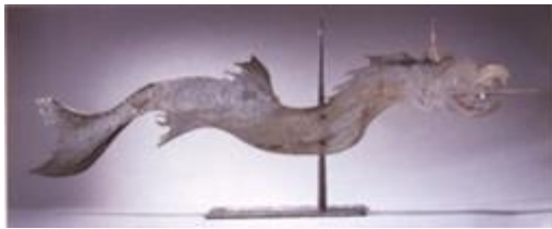
Sea Dragon William Crane, Sr. China, Maine c. 1830–40 Painted pine and iron 30 x 79 x 16 1/2 in. The Newark Museum Purchase 1982 Membership Endowment Fund, 82.149