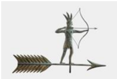
Native American Figure with Drawn Bow and Arrow Artist unidentified Found in Pomfret, Connecticut c. 1870 Copper with traces of original gold leaf 45 x 58 in. Collection of Allan and Penny Katz