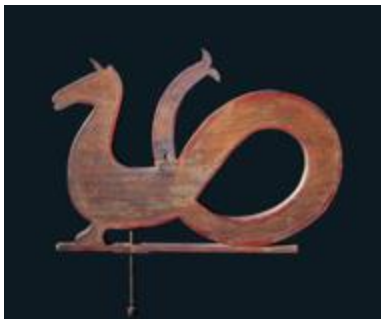
Sea Serpent Artist unidentified New England c. 1850–75 Painted wood, iron 16 1/4 x 23 1/4 x 1 in. American Folk Art Museum Museum Purchase, 1981.12.13