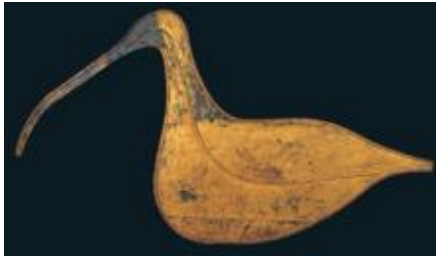
Curlew Artist unidentified Seaville, New Jersey c. 1874 Gold leaf on sheet metal with iron straps 46 1/8 x 92 1/4 x 3/8 in. American Folk Art Museum Gift of Alice Kaplan, trustee (1977–1989), 2001.3.2