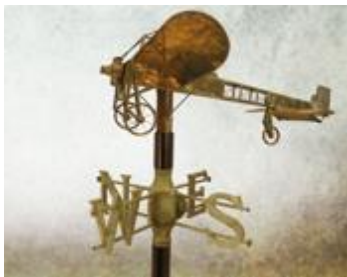
The Blériot XI Monoplane Artist unidentified From the Poland Spring House, Poland Spring, Maine c. 1909–14 Copper 10 x 57 1/4 x 55 in. Collection of Michael and Pat Del Castello