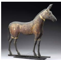
American Mule Artist unidentified Found in Seal Cove, Maine c. 1890–1910 Molded copper with sheet copper ears and embossed mane, mounted on original tubular support 33 x 35 in. Private collection