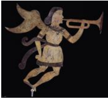
Archangel Gabriel Artist unidentified Northeastern United States c. 1840 Paint on sheet metal 35 x 32 1/2 x 1 1/4 in. American Folk Art Museum Gift of Adele Earnest, 1963.1.1