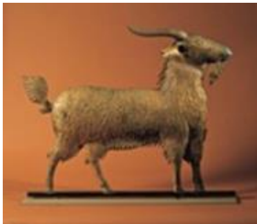
Goat Artist unidentified Northeastern United States c. 1880 Molded and sheet copper with yellow sizing and gold leaf 25 x 31 in.; depth of horns, 4 in. Collection of Julie and the late Carl M. Lindberg