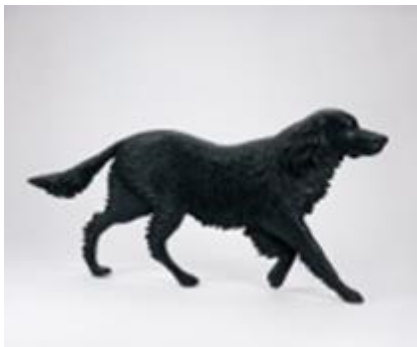
Pattern for McDona's Ranger, English Setter Harry Leach Boston, Massachusetts c. 1871 Carved and painted wood 17 x 35 1/2 x 4 in. Collection of Donna and Marvin Schwartz