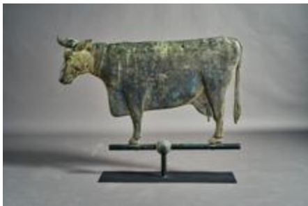
The Cooperstown Cow Artist unidentified Probably New England or New York c. 1881 Molded copper and cast zinc with traces of original gilding 42 x 61 in. Collection of Donna and Marvin Schwartz