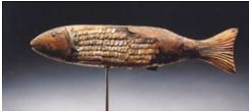
Salmon Artist unidentified Probably New England or New York c. 1875–1900 Carved wood, sheet copper, and molded zinc with gilding and paint 7 x 31 in. Collection of Kendra and Allan Daniel