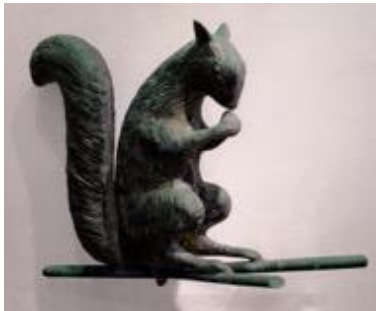
Squirrel Eating a Nut Cushing & White Waltham, Massachusetts c. 1870 Molded copper h. 18 in. on 24 in. long rod Private collection