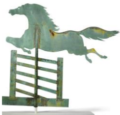
Steeplechase Horse William F. Tuckerman Boston, Massachusetts c. 1850 Painted sheet copper 36 x 26 in. Collection of Nell and Ed Shapiro