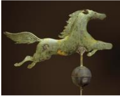
Leaping Horse Artist unidentified Boston, Massachusetts c. 1850 Molded and sheet copper 26 x 36 in. Private collection